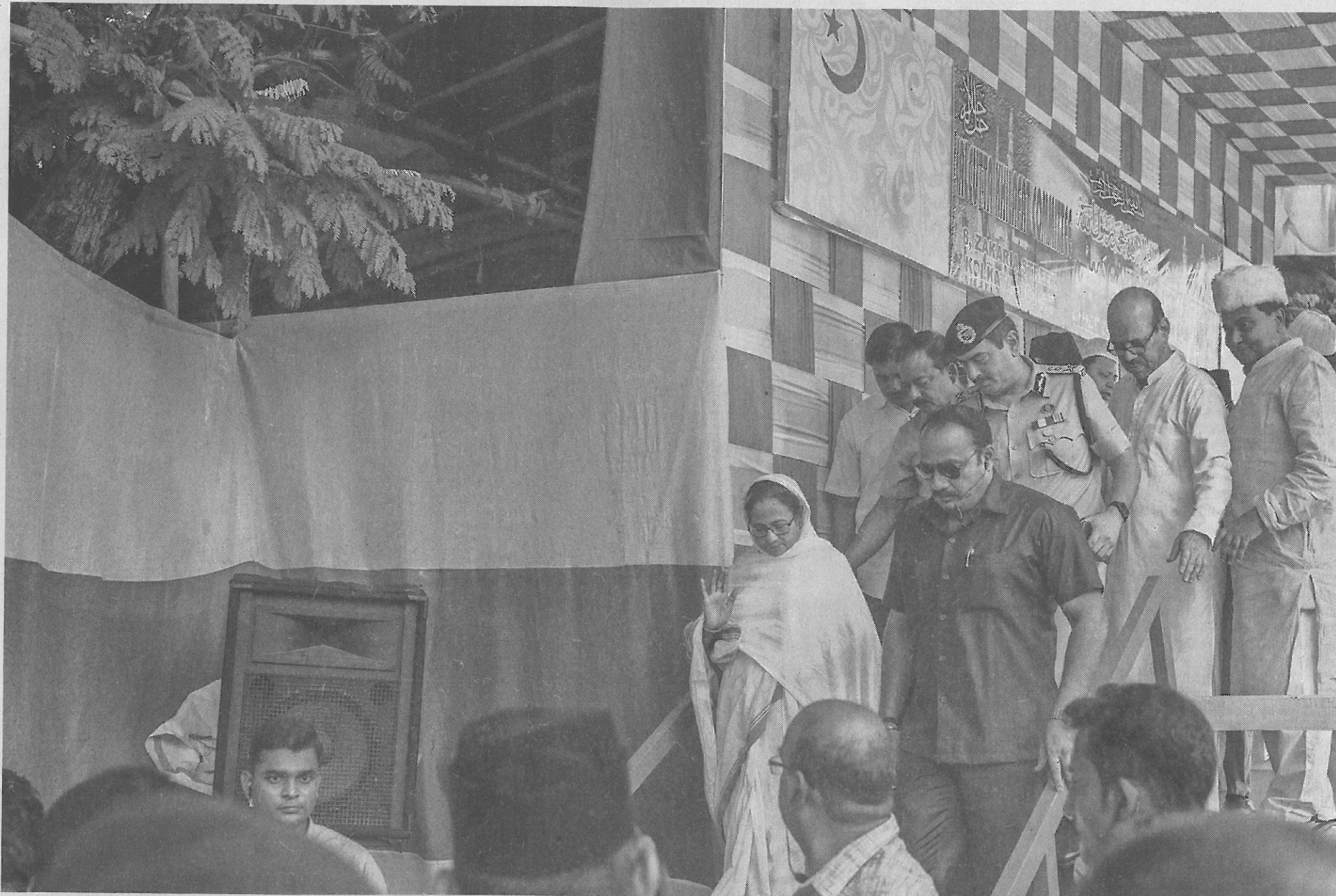
Mamata Banerjee, center, chief minister of West Bengal State, has not backed down from a fight with India's prime minister, Narendra Modi. She has said she wants to "throw Modi out of the country."